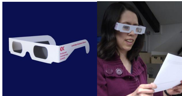
Figure 1: Cambridge simulation glasses

The study used the Cambridge Simulation Glasses, which restrict the ability to see fine detail and perceive contrast differences (Engineering Design Centre, 2011). The glasses are made from a thin, lightweight material so they can be layered to simulate greater levels of impairment (Figure 1). Gloves are also available that restrict the functional ability of the hands. The two can be used in combination to help designers understand the impact of a range and combination of impairments.